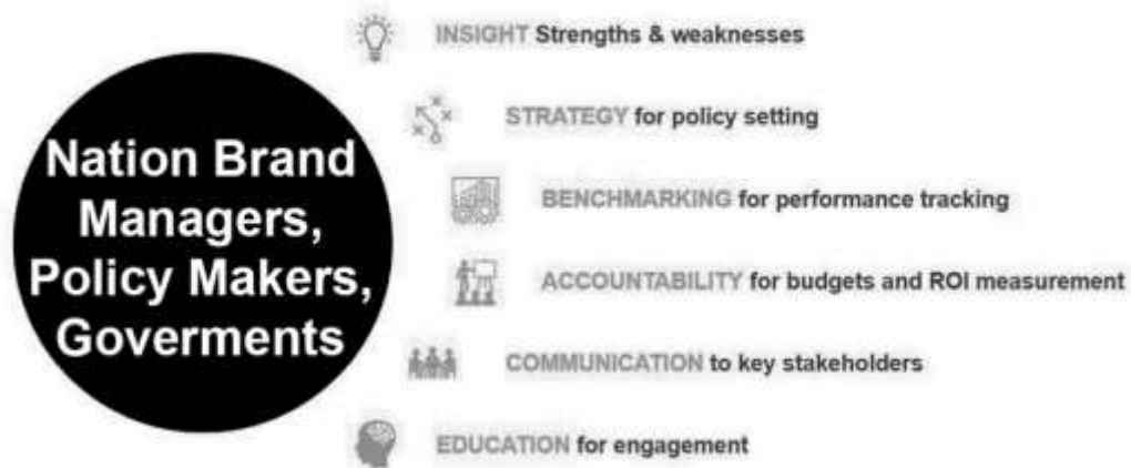
Figure 2. How Can Soft Power Perceptions Be Leveraged By Nations

The Reynolds theory is used to analyse the size of a country's soft power and its types. Reynolds states that there are three levels to measure soft power: cultural propaganda, democratic change, and systemic change.